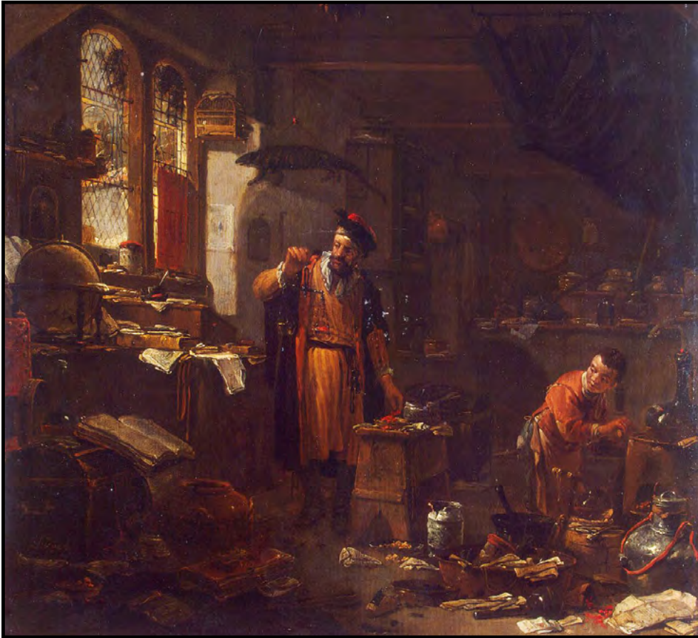
Thomas Wijck, An Alchemist, seventeenth century.

For millennia, mystical experiences—those deeply personal moments of profound insight, unity, or transcendence—have been described by mystics across traditions and cultures. Long viewed as subjective or unprovable, these states of consciousness are now gaining attention in the scientific community, which is uncovering measurable changes in the brain and body that align closely with Rosicrucian teachings on spiritual development and the nature of reality.